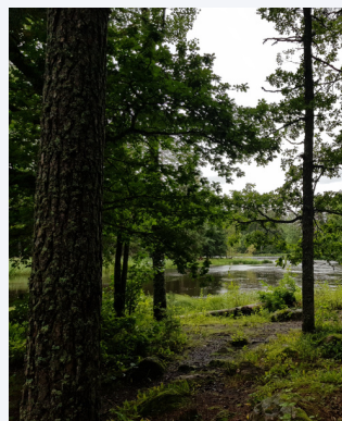
Färnebofjärden National Park, nearby our course venue